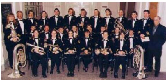
St Keverne Senior Band at the Hall for Cornwall, Truro C. 2000

We are totally self-financing and believe that our efforts provide valuable opportunities for all the people of the Peninsula.