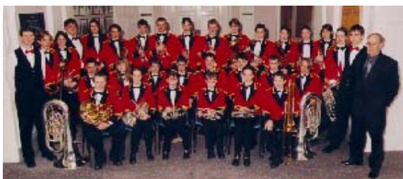
St Keverne Youth Band at the Hall for Cornwall, Truro C. 2000

At present we have over 80 active players. We run beginners classes, a training band, a youth band and a senior band and, especially during recent years, have gained considerable success in Local and National Competitions.